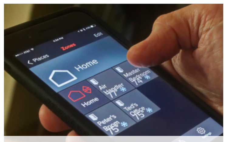
"We use kumo cloud on our phones, and we use it a few times every day. So if we're sitting in the family room watching TV and feeling warm, we just use kumo cloud to change the temperature. Or if we're coming home and want to have the house cooled down before we get there, we can do that."